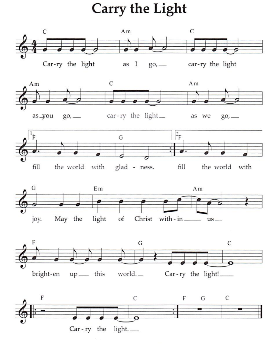
Words and music: Bryan Sirchio. © 2019 Crosswind Music. All rights reserved. Used with permission.