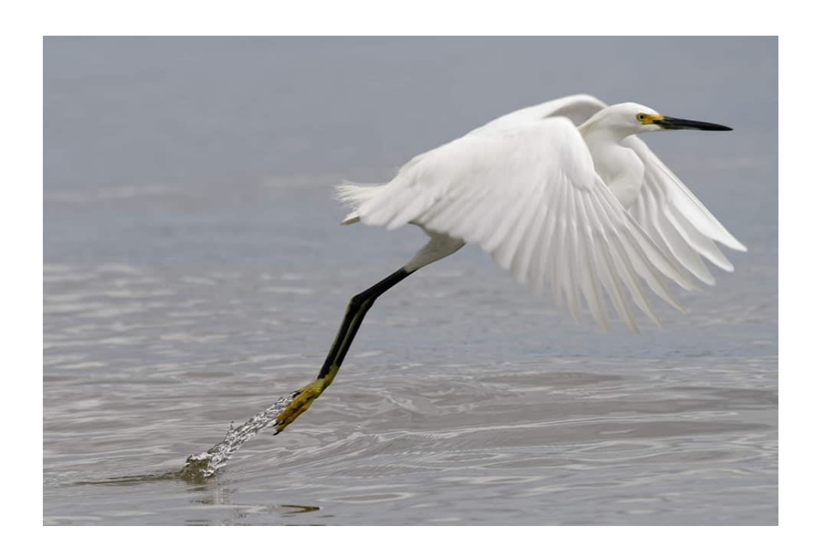
Snowy Egret Photograph by Leland Flora, 2020